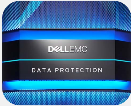
Integrated Data Protection Appliance