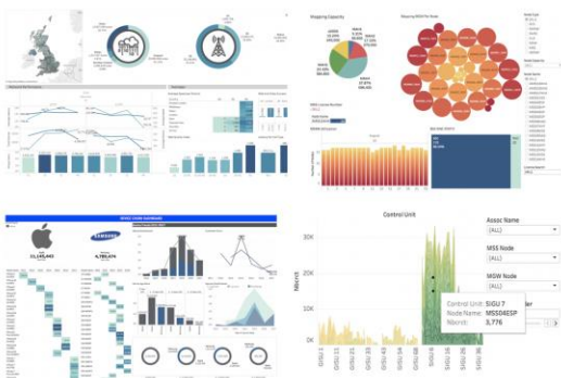
Multiple Use Case Insights