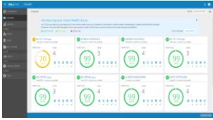
Proactive Health Score