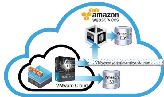
Enterprise class data protection for on-prem and public cloud

Bringing the first cloud-enabled, self-service data protection for VMware's enterprise class Software-Defined Data Center to the AWS Cloud. Whether expanding services on-premises or in the public cloud, Dell EMC provides the same world class data protection with superior compression and deduplication. Dell EMC delivers industry-leading data protection at the lowest cost to protect. Ordering is made simple. Dell EMC Data Protection for VMware Cloud on AWS is available as a single bundle and includes the data protection software and protection storage needed to protect your data and applications running in VMware Cloud™ on AWS.