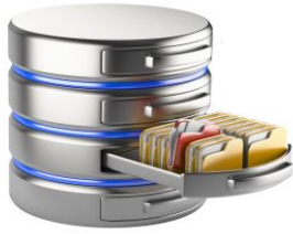
20 MOUNTED COPIES