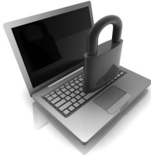
SINGLE ARRAY PER APPSYNC SERVER