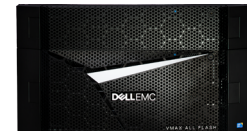
Any VMAX All Flash model