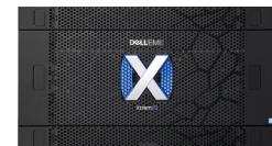
Any XtremIO array