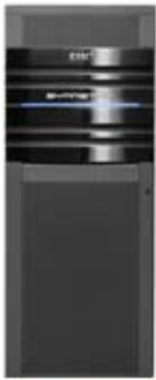
EMC Symmetrix VMAX

FAST automates the process of moving the right data to the right place at the right time, maximizing business investments in a tiered storage environment.