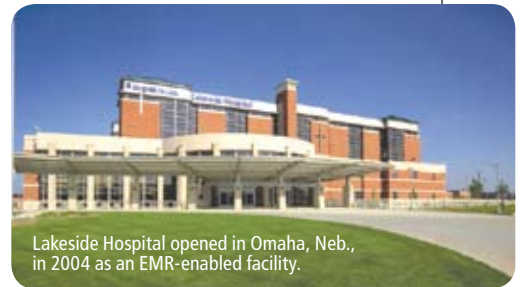
Lakeside Hospital opened in Omaha, Neb., in 2004 as an EMR-enabled facility.