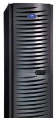
Alegent Health’s imaging archives are being migrated to two EMC Centera content addressed storage systems.

Storage is an essential ingredient. Maximize your storage investment by developing a robust, future-oriented platform.