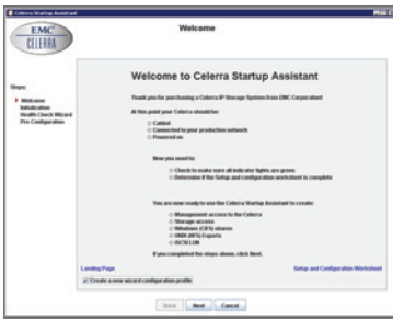
Celerra Startup Assistant 15 Minutes from Power-up to Production